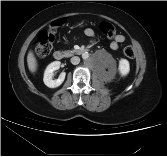
Fig. 1. Abdominal CT scan prior to treatment demonstrating a bulky retroperitoneal tumor.

patient needed admission to the hospital because of dyspnea with dry cough. She presented fine bibasilar crackles and hypoxemia. Prednisone dose to 1 mg/kg/day, oxygen therapy and broad-spectrum antibiotics was initiated. Pulmonary function tests showed a diffusion lung capacity of carbon monoxide (DLCO) markedly decreased to 30%. In the high-resolution chest tomography the findings were compatible with a diffuse interstitial pneumonitis (clear-worsening compared to previous CT scan) (Fig. 2). The bronchoscopy with alveolar washing was normal and without diagnosis in the transbronchial biopsy.