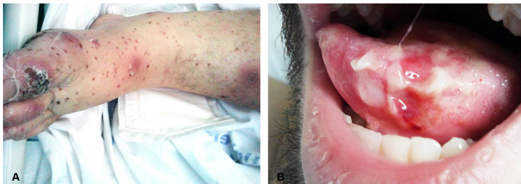
Fig. 2. Herpetic lesions in his left leg (A); and massive aphthous-like ulcerations in oral mucosa with pseudomembranes (B).

Initial clinical presentations are variable: severe viral infections, disseminated NTM infections, MDS/AML, lymphedema, and invasive fungal infections. From those, our patient presented a severe HSV infection, MDS and lymphedema.